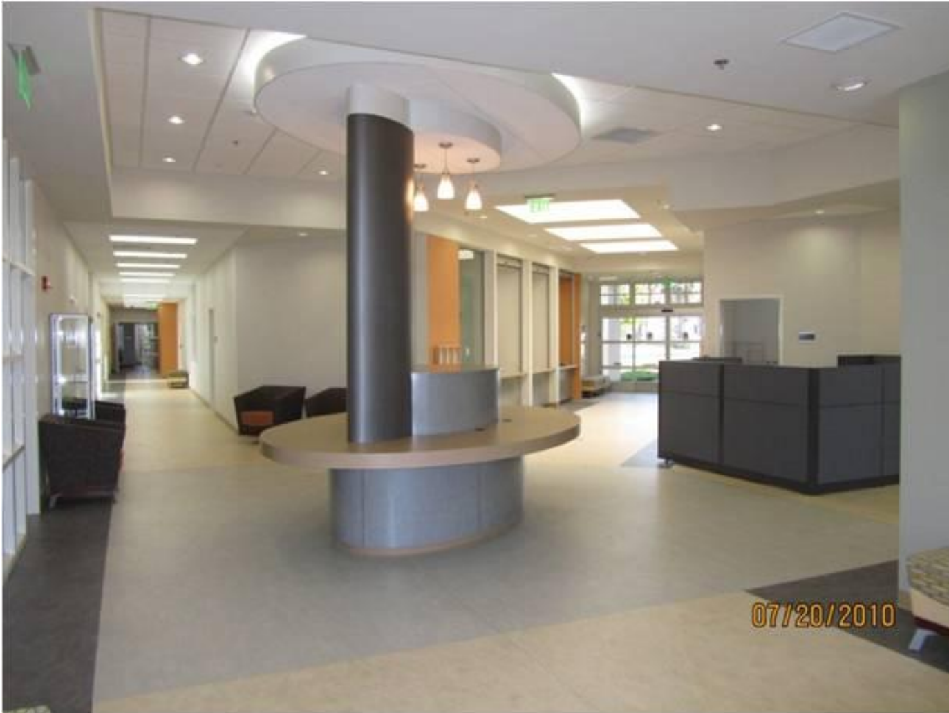
Building 700 – Student Services Center